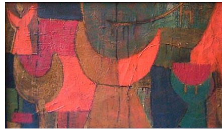
Morning Snow Enamel on board 1952 (l) and Checkmate Casein on board 1953 (r)